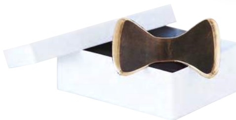
James Virgo Artwork Bronze Bow Tie, available from Debut Contemporary; £200 (US$309)