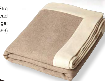
Oyuna Etra cashmere bedspread in taupe with beige; £1,599 (US$2,599)