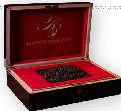
Bespoke Beverages KL Diamond coffee; £8,500 (US$13,112) per 250g