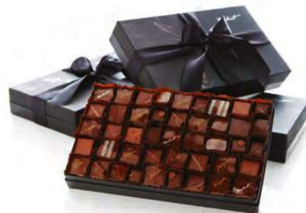
Recchiuti Platinum Collection box of chocolates; US$168