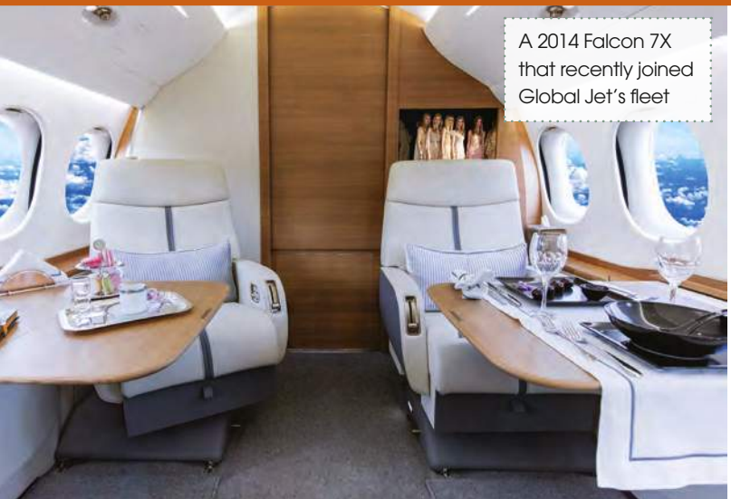
A 2014 Falcon 7X that recently joined Global Jet's fleet