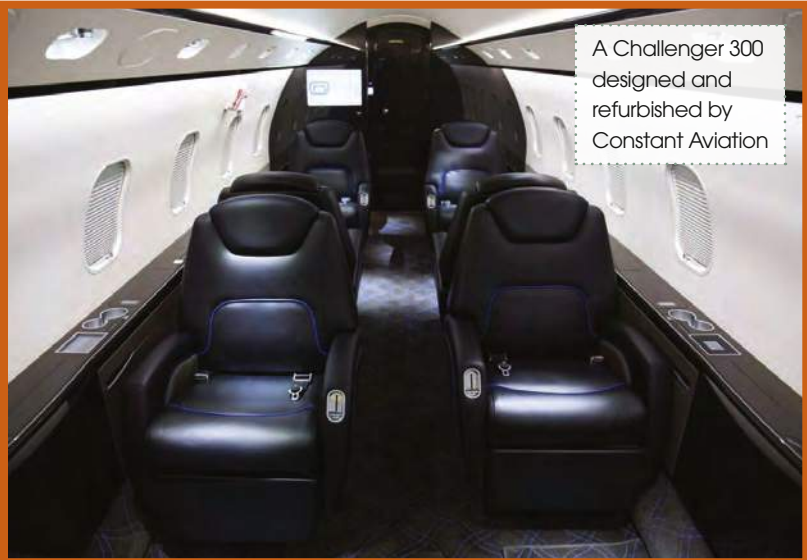
A Challenger 300 designed and refurbished by Constant Aviation