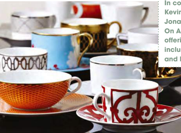
In conjunction with Kevin Glancy and Jonathan Fawcett, On Air Dining is now offering amenities including dinnerware and linen